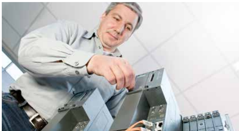
Upgrade on the run – often during production.

We offer modernizations precisely tailored to your needs, which upgrade your systems and assure their future. We will, of course, also support you with the parameterization, adjustment and optimization of your system.